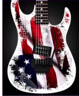
AMERICANA SERIES SERIES - DISTRESSED US FLAG 2

Hundreds of unique awesome designs to choose from! inzaneskins.com