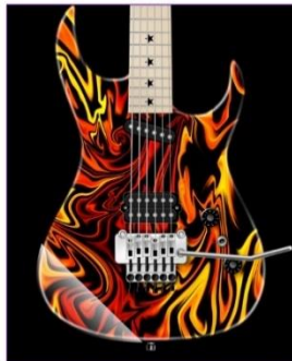
SWIRLS SERIES - SWIRLS 10