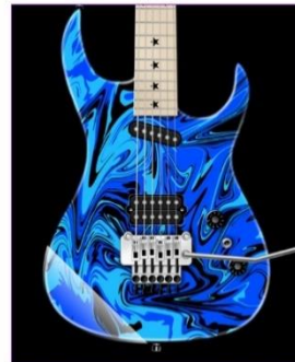
SWIRLS SERIES - SWIRLS 9

NEMA HANDMADE GUITARS will install and clear coat your INZANE SKIN design to a shimmering finish before final construction. *INZANE SKINS GUITAR WRAPS MUST BE PURCHASED SEPARATELY. (ADDITIONAL CHARGE FOR INSTALLATION)