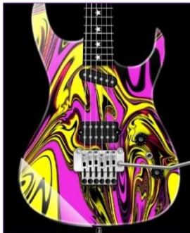
SWIRLS SERIES - SWIRLS 2020-1

Hundreds of unique awesome designs to choose from! inzaneskins.com