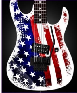
AMERICANA SERIES SERIES - DISTRESSED US FLAG 3