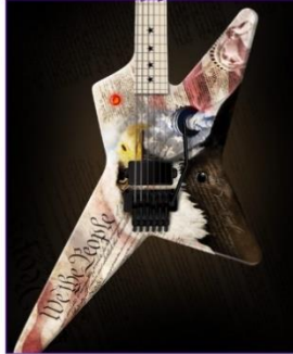
AMERICANA SERIES SERIES - WE THE PEOPLE 3